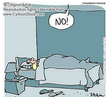
It was the answer to his prayers. Not the one he was hoping for, but an answer nonetheless.

This fall we will focus on the three ways of spiritual life. In September, our sermons will focus on the purgative way. In October, the illuminative way. In November, the unitive way.